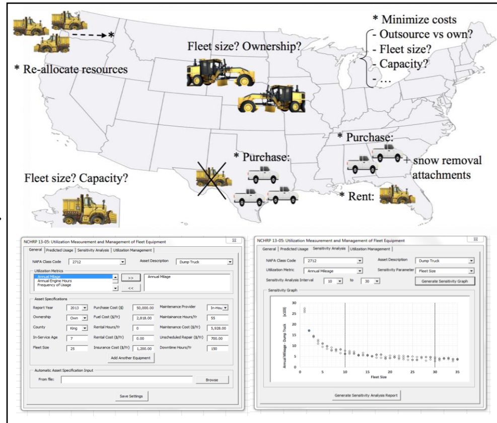
Utilization Management: Resource planning & allocation

Sample Research Activities: (b) Utilization measurement and management of fleet equipment.